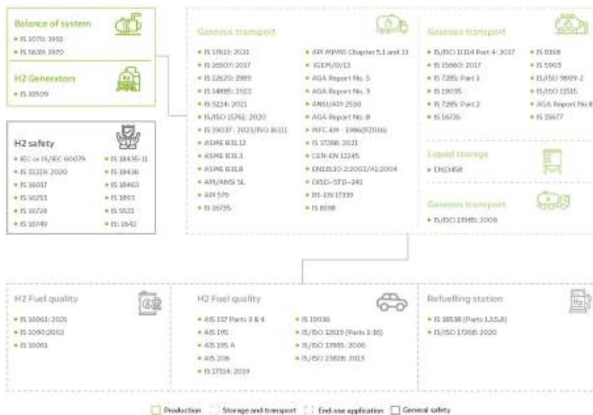
Figure 3: Overview of existing standards related to Green Hydrogen in India

Further, the existing standards are bifurcated into those developed or adopted before and after the launch of the NGHM. The bifurcation helps to track the progress made in the development of Green Hydrogen standards in India. A detailed analysis reveals that 53 standards were developed and issued before the launch of NGHM. Table 4 provides the details of the standards launched before the NGHM. BIS, with 49 standards, has issued the most among these.