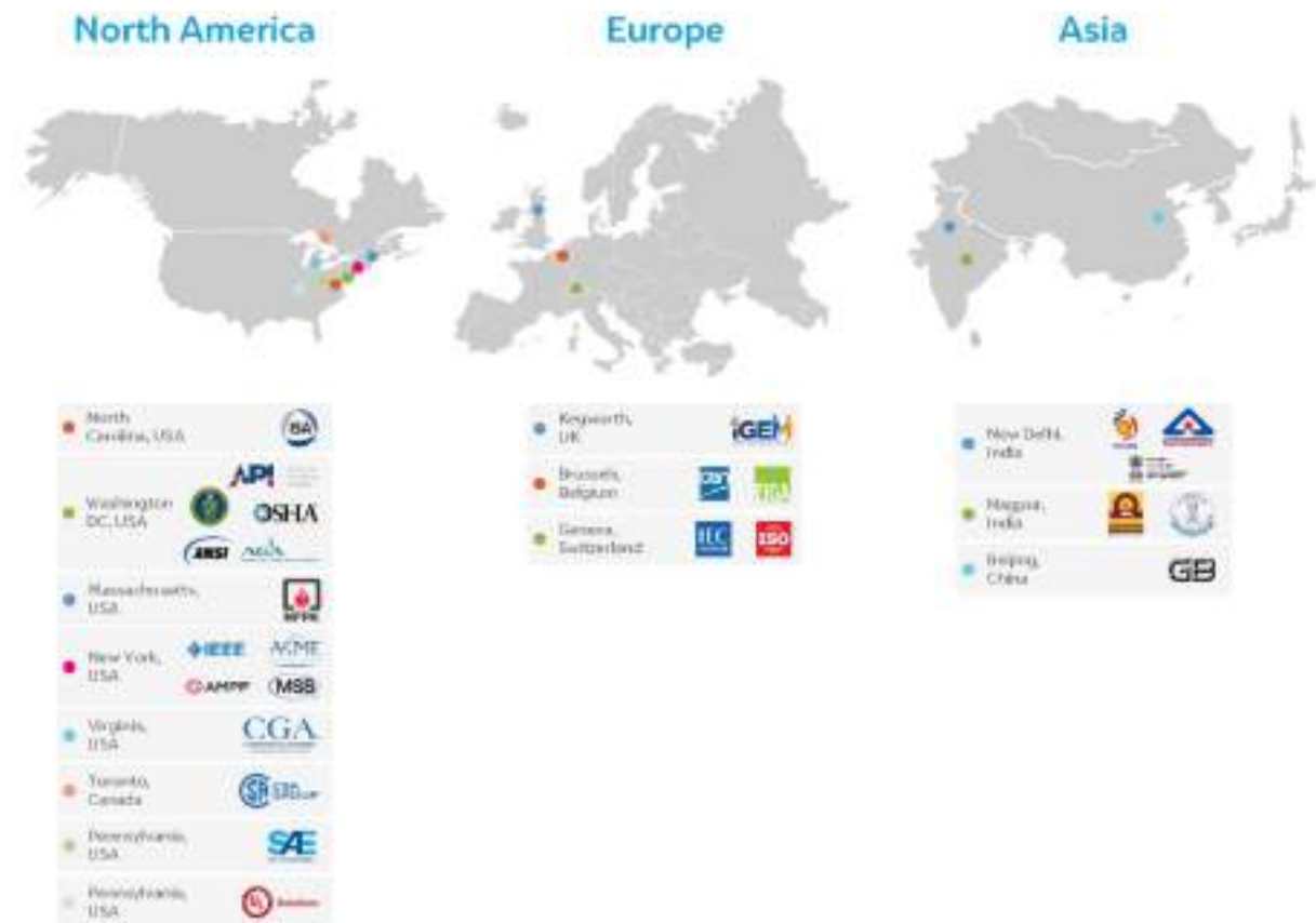
Figure 2: Overview of international entities involved in developing standards on Green Hydrogen

Table 2 provides an overview of the international entities involved in developing standards across the Green Hydrogen value chain. These include statutory or advisory bodies, like the International Organization for Standardization (ISO), the American Society of Mechanical Engineers (ASME), and the International Electrotechnical Commission (IEC) etc. The national bodies responsible for developing and/or notifying safety standards across various countries are also members of these international entities. Therefore, these organisations play a critical role in creating consensus-based, market-relevant, consistent standards that provide technical support and guidance for developing standards across the value chain in their member countries.